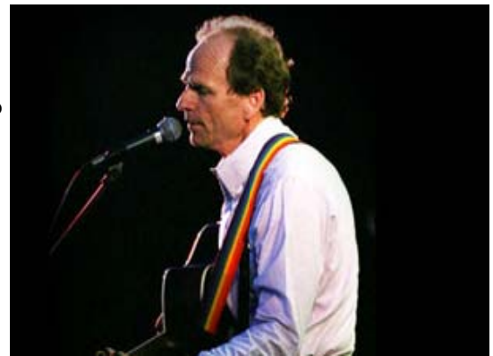
Livingston Taylor, called "consistently impressive," by The Washington Post , will headline the WLT celebration.

For over thirty years, Livingston Taylor has toured with such major artists as Linda Ronstadt, Jimmy Buffett, Fleetwood Mac, and Jethro Tull. He has recorded eleven albums, and is a full professor at Berklee College of Music in Boston where he has taught since 1985. Currently, Taylor is an artist-in-residence at Harvard University.