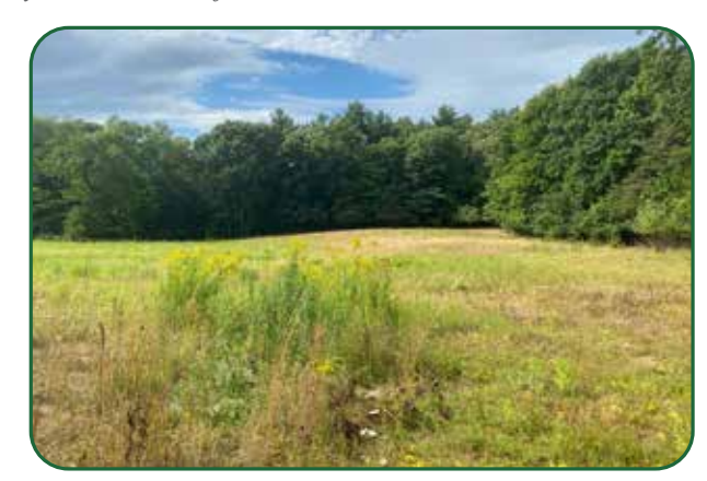
A view of the protected meadow

While the deed restriction permits a larger home, the new owner elected to preserve and update the existing house and add a modest addition, keeping more of the lot as open space. WLT worked closely with the builder to ensure it remained in keeping with the style and scale of the historic structure.