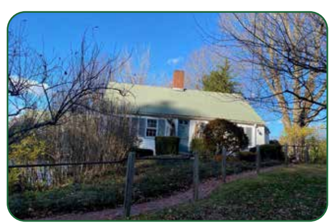
Circa 1750 home, prior to renovation