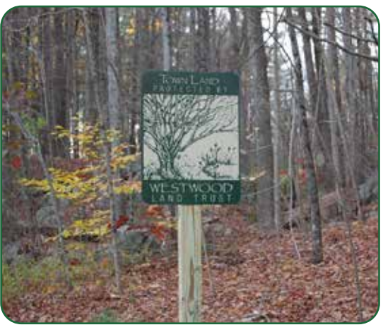
Hunnewell Property next to Lowell Woods