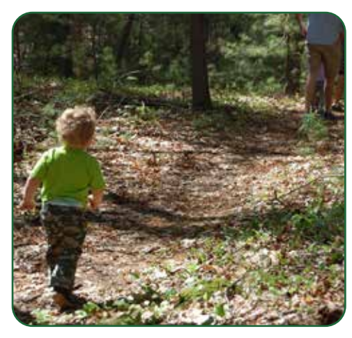
Hiking at Sen Ki - 1255 High Street